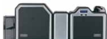
Lamination option and dual-sided printer/encoder